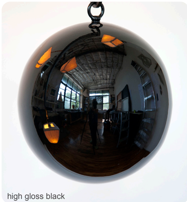
high gloss black