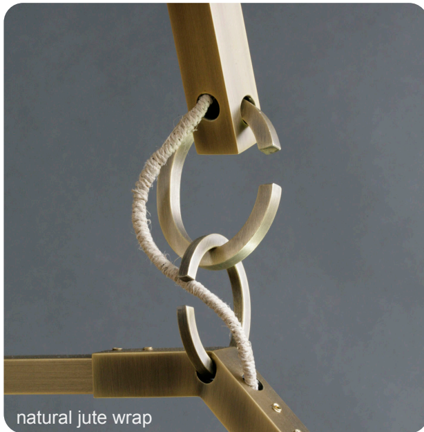
natural jute wrap

“C” ring joints between the frame legs have small lengths of exposed electrical wire where the joint moves. These joints are hand wrapped with jute to match the color of your metal.