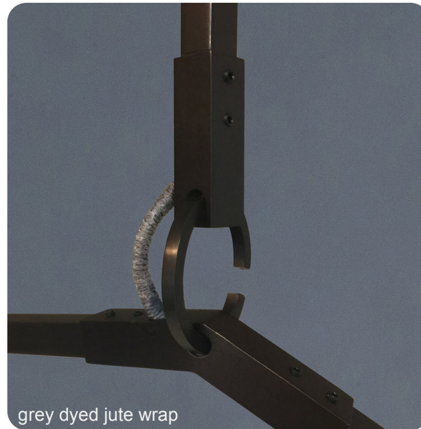
grey dyed jute wrap